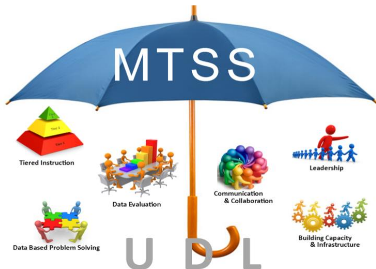
Figure 2: MTSS Core Principles